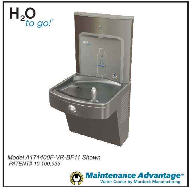
Model A171400F-VR-BF11 Shown PATENT# 10,100,933

Bottle Filling unit shall include Pushbutton operated activation. Housing construction will be 20 gage Stainless Steel with a satin finish and will also include components manufactured with Antimicrobial, impact resistant ABS. Bottle Filler shall provide approximately 1 GPM flow rate with a Laminar Flow Spout to minimize splashing. Optional -WF1 has a 1500-gallon capacity, has NSF/ANSI 42 & 53 certification and reduces lead content in the drinking water by 99%.